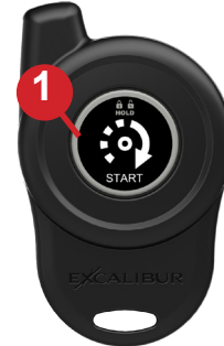
1. START button