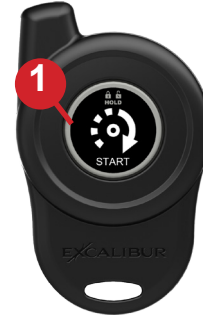
1. START button