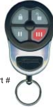
Omega part # 148-07

5th Channel - Press the Unlock and "III" buttons together.